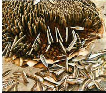
3rd Place - Youth - Flora Irene Wey