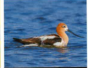
2nd Place - Adult - Fauna Rebecca Pescosolido