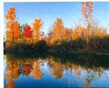
3rd Place - Youth - Landscape Mason Cunningham