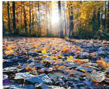
1st Place - Youth - Landscape Clare Turnwald