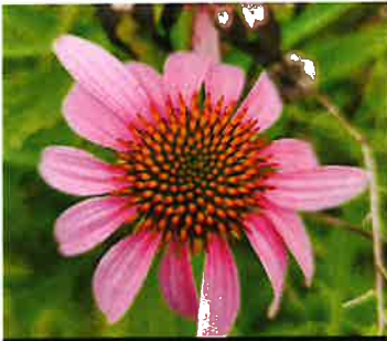
2nd Place - Youth - Flora Phoebe Hodges