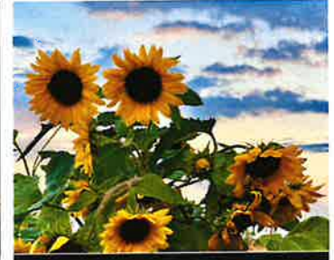
1st Place - Adult - Flora Benjamin Rife