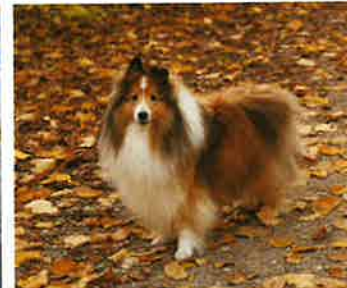
2nd Place - Adult - Parks Potpourri Duc Tran