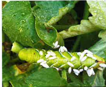
3rd Place - Youth - Fauna Irene Wey