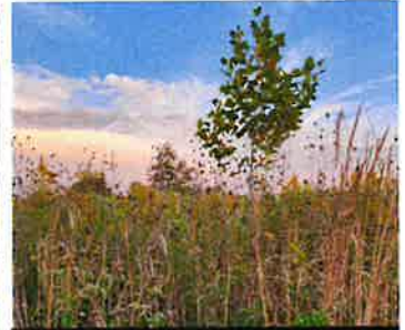
2nd Place - Youth - Landscape Abram Hodges