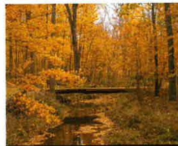
2nd Place - Adult - Landscape Bobbie Dawson