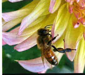
1st Place - Youth - Fauna Irene Wey