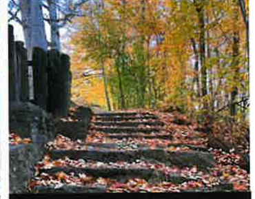
3rd Place - Youth - Parks Potpourri Clare Turnwald