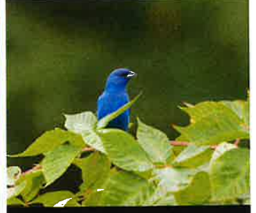
2nd Place - Youth - Fauna Mason Cunningham