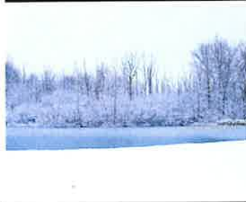
1st Place - Adult - Landscape Grace Bailey