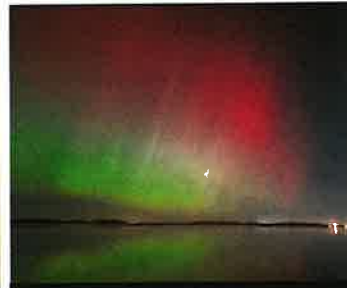
3rd Place - Adult - Landscape Awilda Ortiz-Pastor