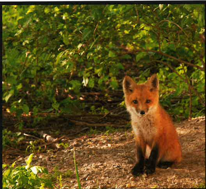
Best of Show Brad Crawford