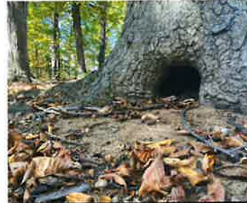
1st Place - Youth - Parks Potpourri Caleb Schroeder