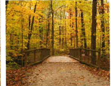
3rd Place - Adult - Parks Potpourri Duc Tran