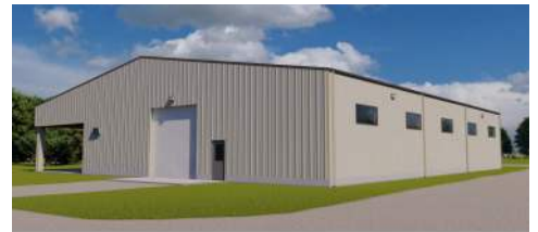
JAMPD - Vehicle Storage Building Design Development - 02/27/2023

Along with the expansion of the new Park District Headquarters in 2022, the Park District has seen the need for an additional storage facility. This new facility will be mainly for our fleet of vehicles that operate daily to keep the parks clean and safe. This project began in August and is set to be finished in late March 2025.