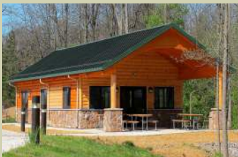
Hermon Woodlands West Shelter & Interior