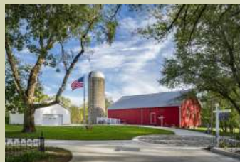
Lauer Historical Event Barn & Interior

Lauer Barn - $300 - 5 hrs., $50/each additional hour