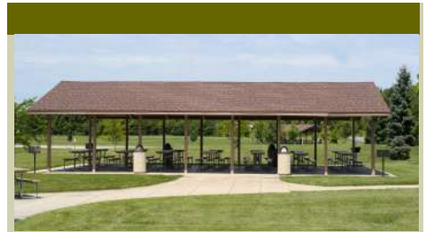
Erie Shelter at Ottawa Metro Park

Pergola - 10 am to 2 pm or 3 pm to 7 pm - $50